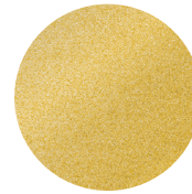
Textured Brass Finish