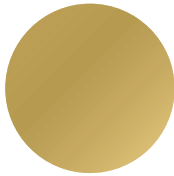
Matte Brass Finish